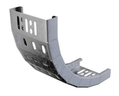
Illustration shown is medium duty